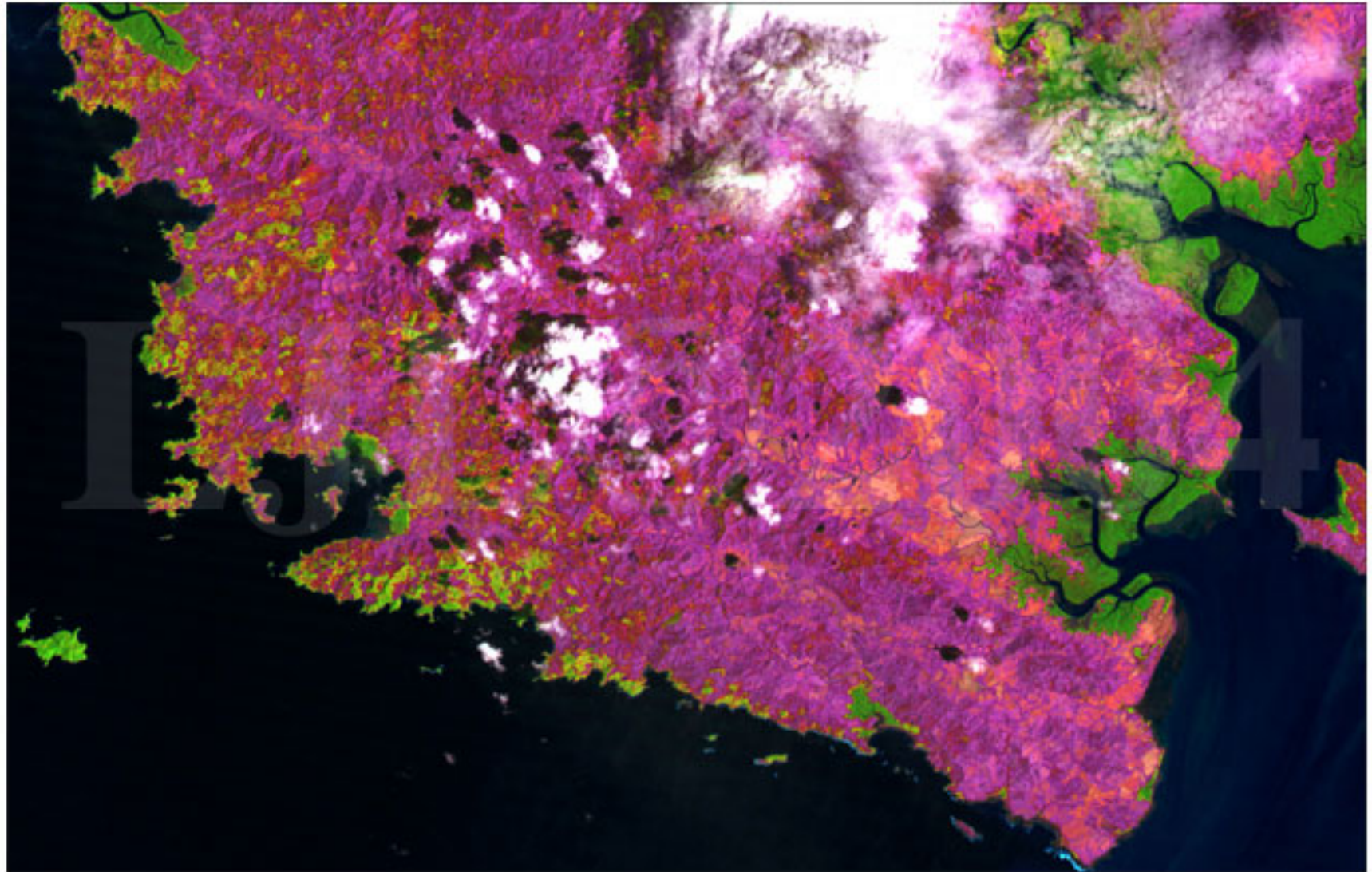
Fig. 1. Satellite image of Soná Peninsula in 1990, obtained by composition of Landsat bands TM3, TM4 y TM5